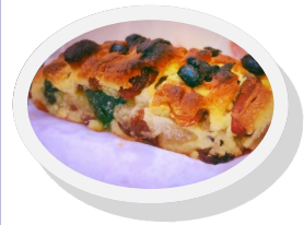
The Jewish Pizza

It's my hope, and I hope it's yours too.